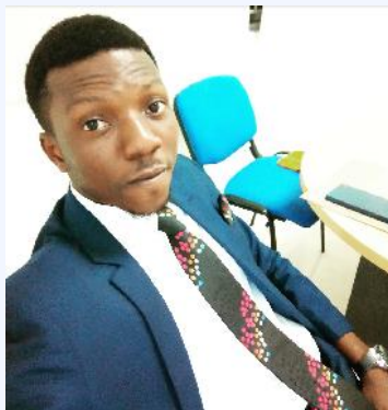
Solomon Osaigbovo Sports Contributor